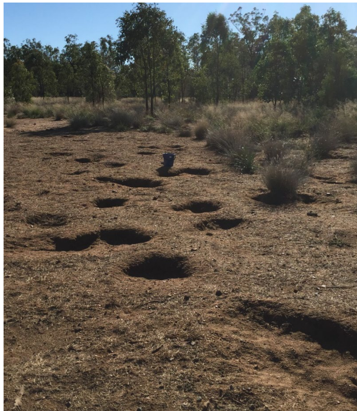
Figure 3-3 Outer range area of Shed B at clean out, beyond the manure pile, showing hollows excavated by hens

A 10 L plastic bucket in the centre of the image provides scale.