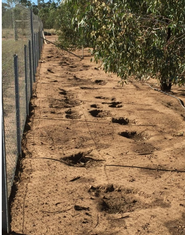
Figure 3-2 Inner range area of Shed B at clean out, showing hollows excavated by hens along boundary fence