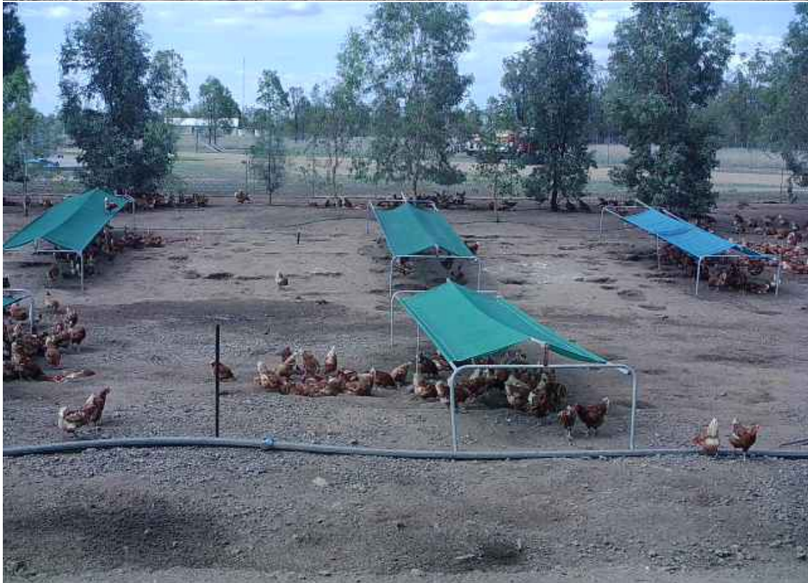
Figure 3-4 Remote camera images the inner range area showing hen ranging behaviour for Shed A (top) and Shed B (bottom) at a flock age of 50 and 52 weeks, respectively

Portable shade structures and native trees can be seen in the middle and backgrounds of both images.